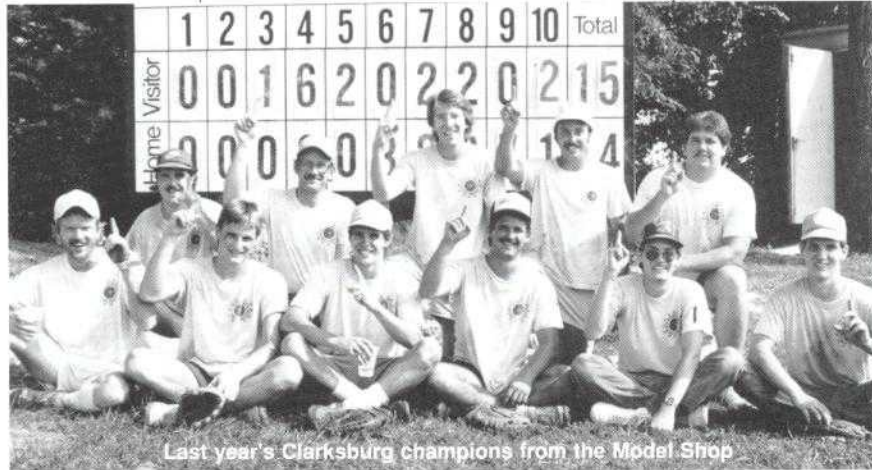
Last year's Clarksburg champions from the Model Shop

The pennant for the L'Enfant Plaza team will also be decided in mid-August, by a single elimination tourney. ■