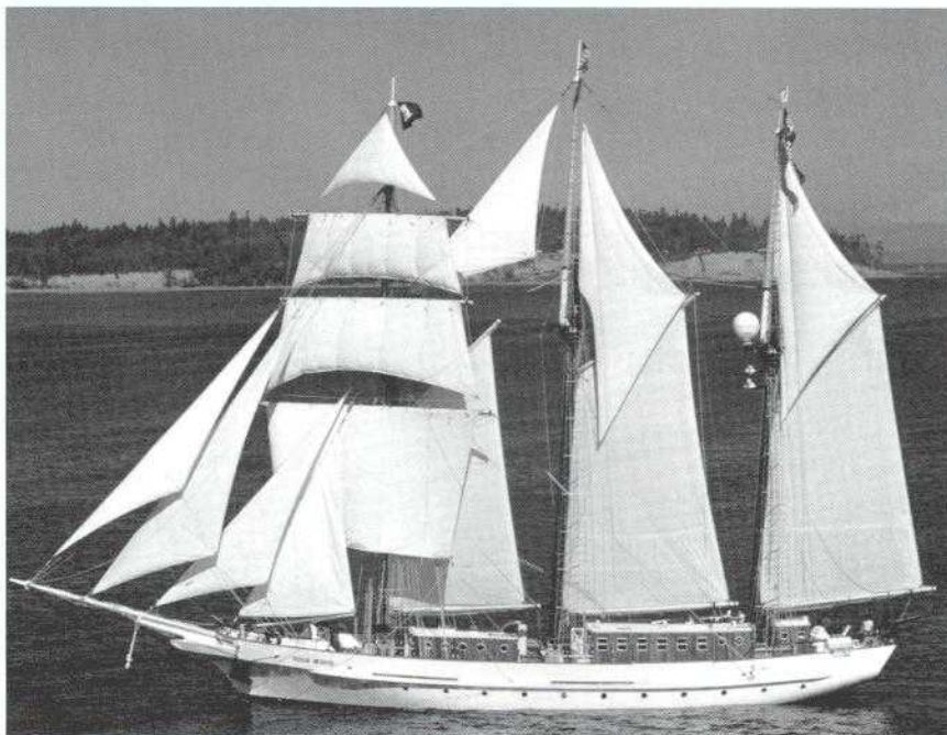
Fair Winds, Following Sea

The "Tole Mour," a sailing ship which brings health care outreach programs to the Marshall Islands, relays medical information via satellite with a maritime antenna donated by COMSAT. Owned and operated by Hawaii's Marimed Foundation, the ship is a traveling health care clinic which recently completed a tour of a remote atoll in the region, providing immunizations, nutrition education, pediatrics clinics and dental screening.